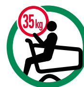
Place the child in the trolley