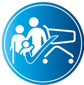
EL 212 BEN'S CART Shopping trolley with seat and safety belt