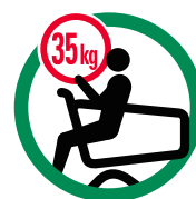
Place the child in the trolley