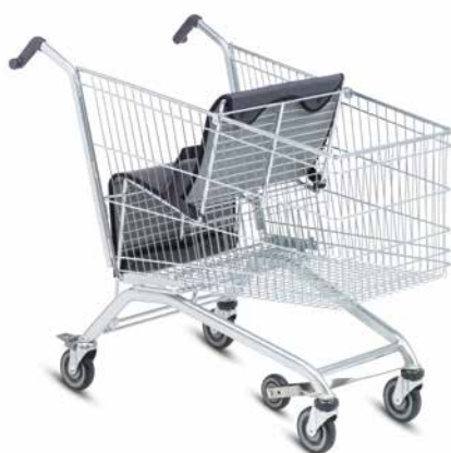
EL 212 BEN'S CART