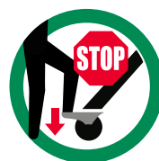
Park Ben's Cart

Secure Ben's Cart behind the customer's car using the brake castor. Release the safety belt on the trolley and lift the child into the trolley. Fasten the safety belt. Release the brake on the rear castor and away you go.