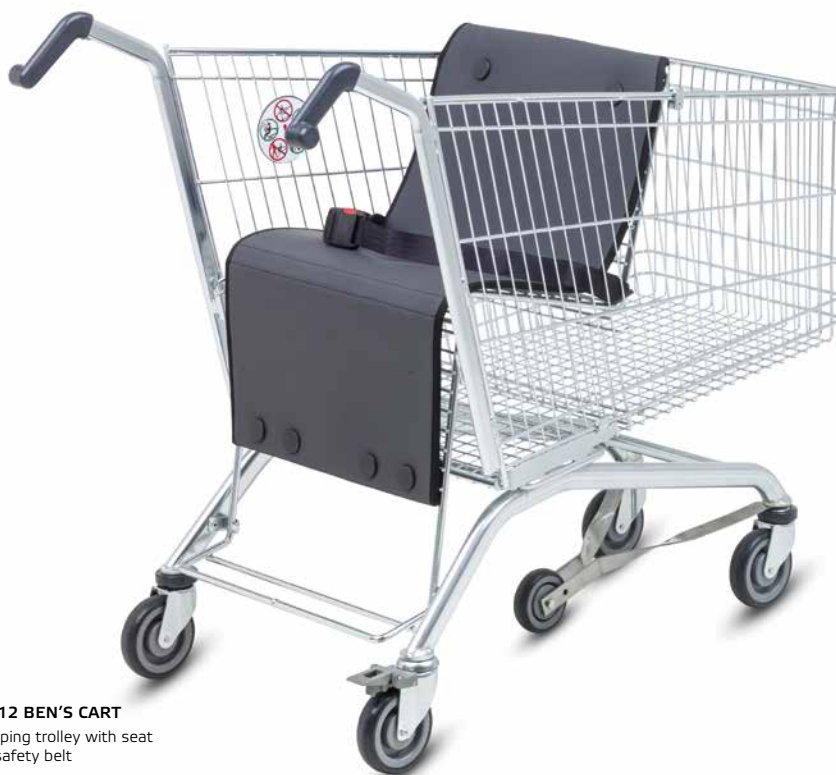
EL 212 BEN'S CART Shopping trolley with seat and safety belt