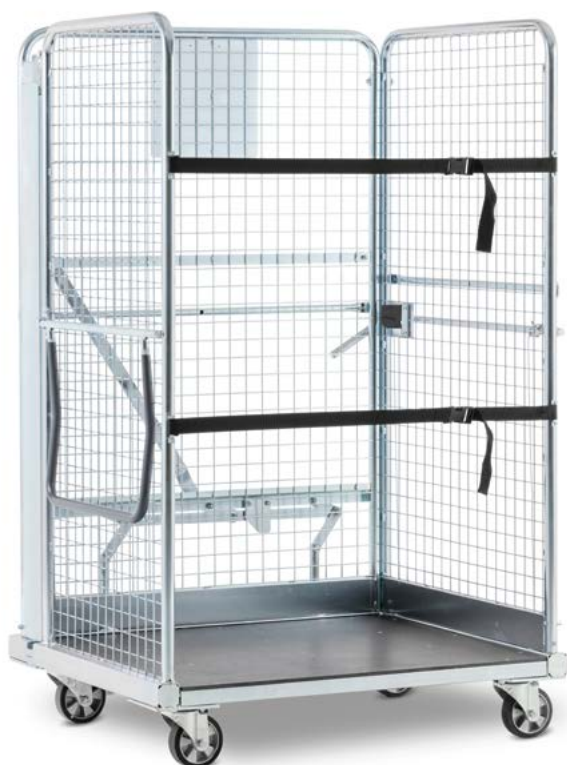
SINGLE PACKAGE ROLL CONTAINER