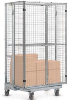
Available in numerous models

From multi-channel distributors to large online retailers: we manufacture our products tailored to the respective logistics concept. And if it needs to be a little more, we also deliver large quantities in a short time.