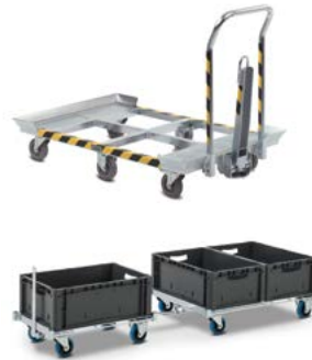
For pallets and boxes in the tugger train