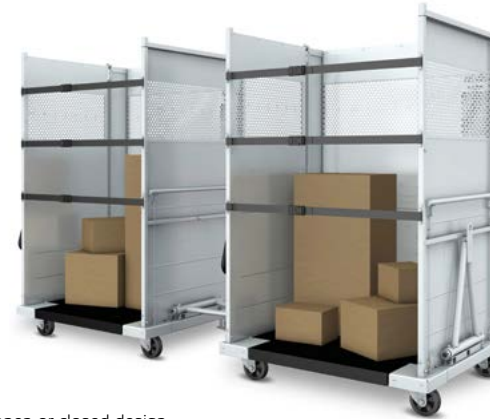
In open or closed design