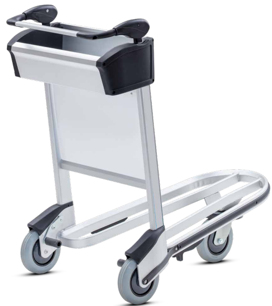
VOYAGER EVOLUTION 3000 BL Luggage transport trolley