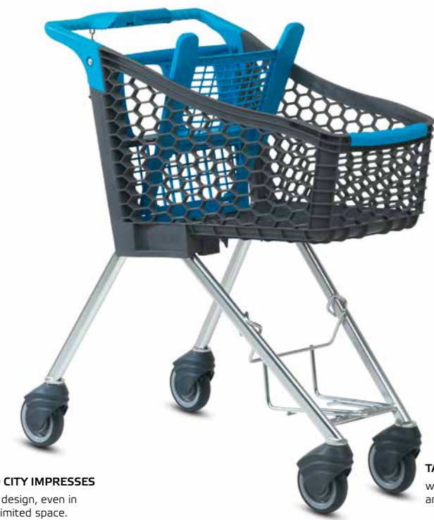
THE TANGO CITY IMPRESSES with its slim design, even in stores with limited space.

■ The innovative and trendy Tango City shopping trolley is ideally suited to small and medium-sized stores and as a secondary trolley. With its easy handling for quick shopping trips and convenient, shallow basket, Tango City is sure to please.