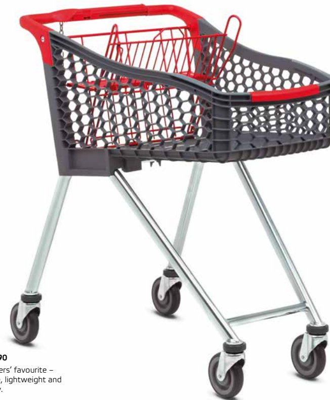
THE TANGO 90 is the customers' favourite – manoeuvrable, lightweight and runs smoothly.

■ The compact, handy Tango 90 is always there when you need it: for small purchases or last-minute shopping trips. With its convenient equipment, it is the equal of its larger counterparts.