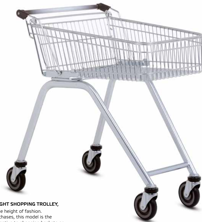
WITH THE LIGHT SHOPPING TROLLEY, you'll be at the height of fashion. For small purchases, this model is the superior alternative to shopping baskets or reused bags.

■ The Light shopping trolley is the secondary trolley produced in a wire version. Easy handling perfectly complements your standard fleet. The shallow 70-litre shopping basket is easy to load, making it the first choice for many customers.